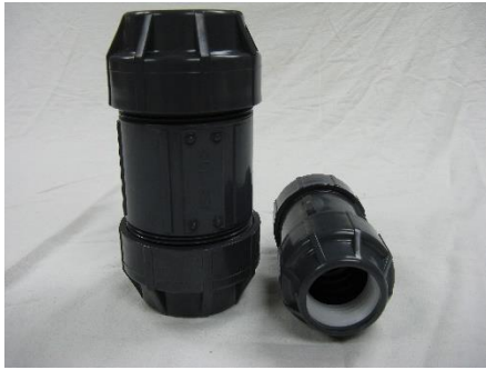
½" TO 2" IPS