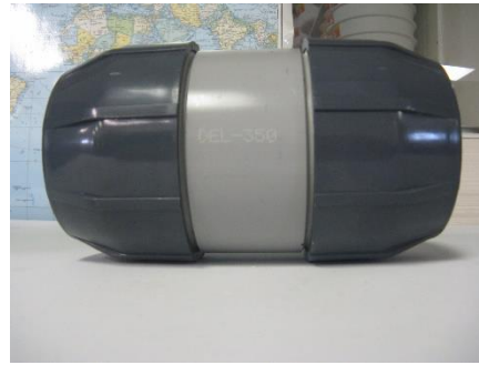
2½" TO 4" IPS